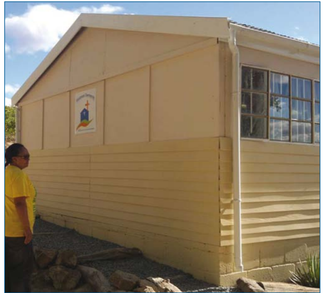
A remarkable difference made to the community centre with wall cladding, fascia boards and gutters by Southern Profiles.