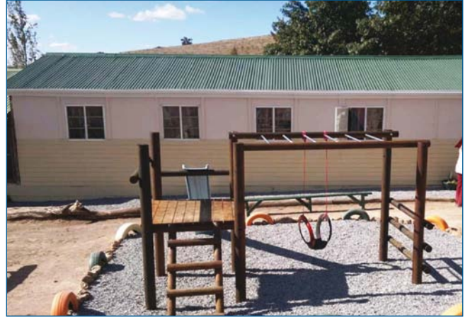
The Mooiplaas Community Centre before and after the make-over co-ordinated by Newkidz on the Block.