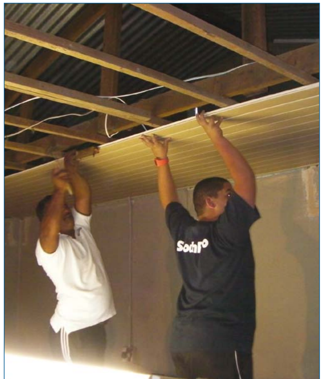
Southern Profiles' volunteers hard at work.